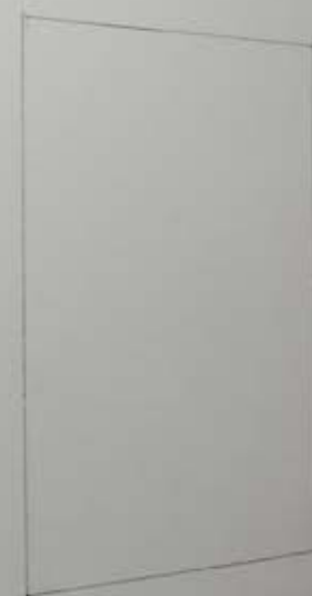
installation view (main gallery) PlaceMAK gallery, Seoul, South Korea

Empty squares are drawn by Lydon, to represent the artworks that Gomsil Forest did not wish to exhibit.