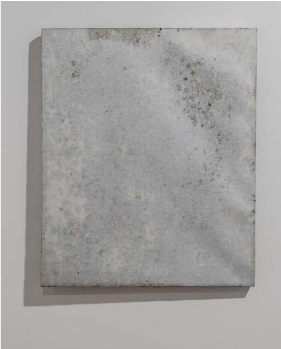
Untitled #2, 46x38, forest on canvas, 2018 Gomsil Forest