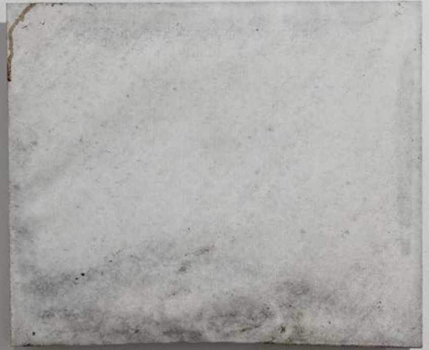
Untitled #5, 46x38, forest on canvas, 2018 Gomsil Forest