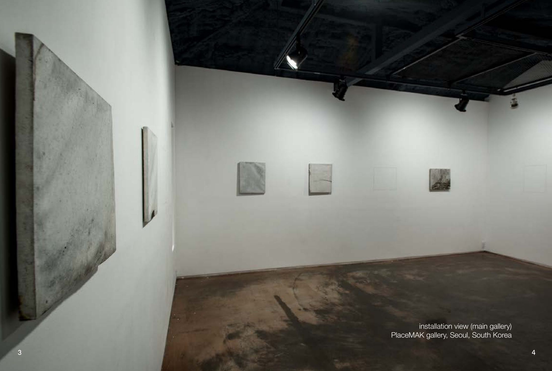
installation view (main gallery) PlaceMAK gallery, Seoul, South Korea