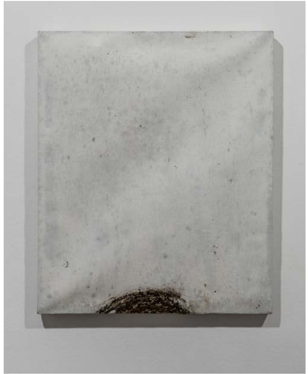
Untitled #7, 46x38, forest on canvas, 2018 Gomsil Forest