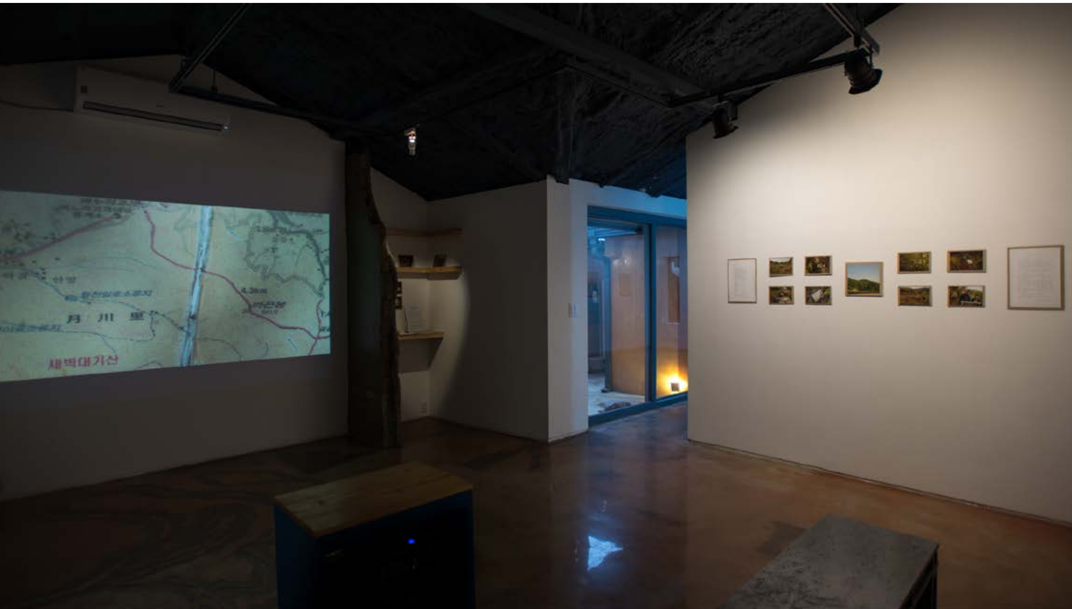
installation view (film screening gallery) PlaceMAK gallery, Seoul, South Korea