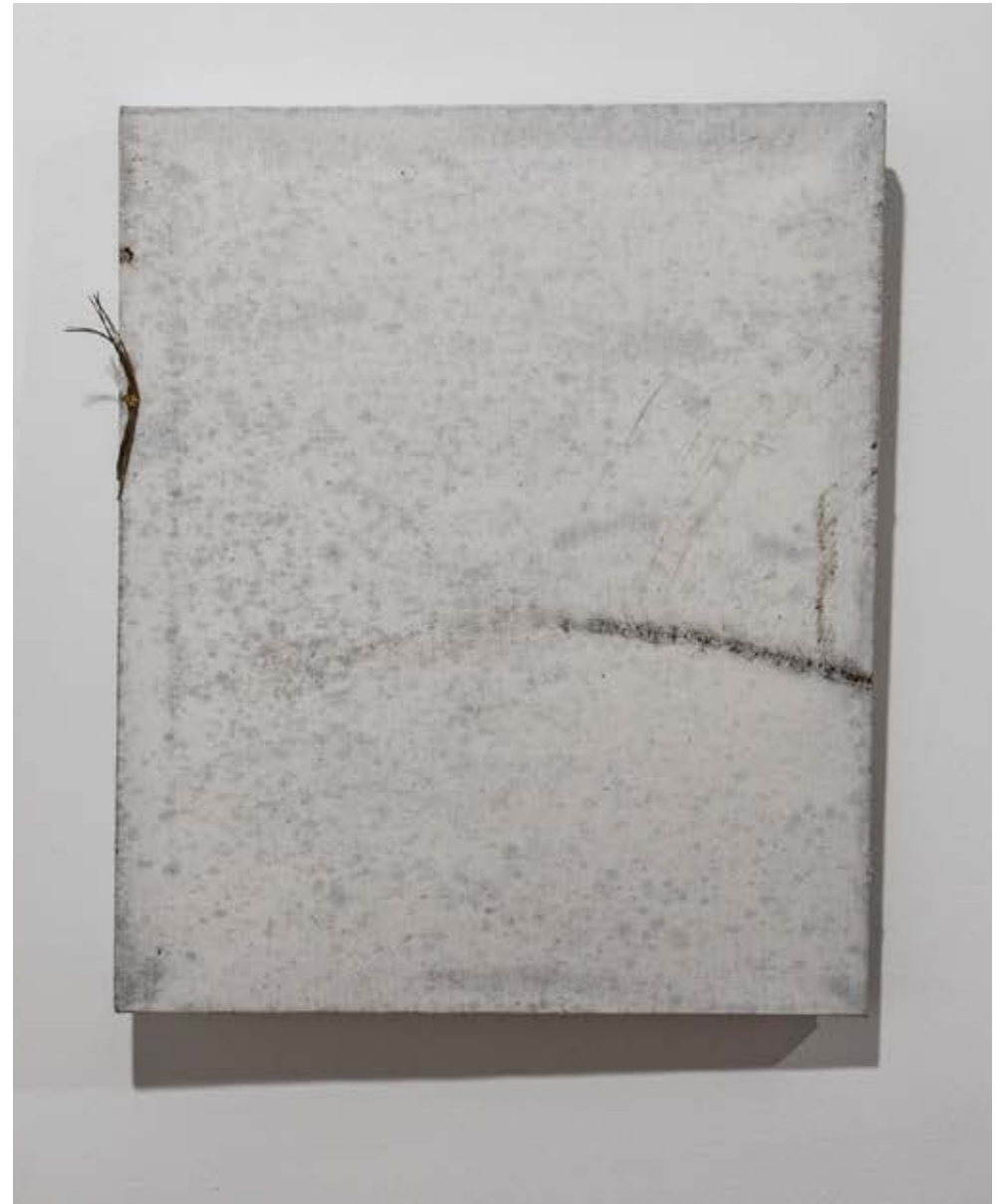
Untitled #1, 46x38, forest on canvas, 2018 Gomsil Forest