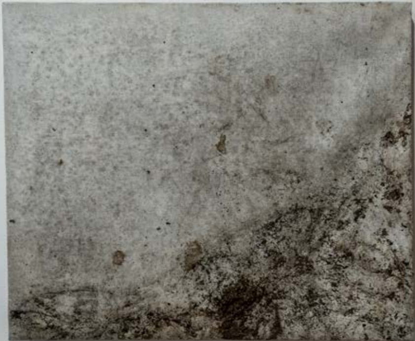
Untitled #4, 46x38, forest on canvas, 2018 Gomsil Forest