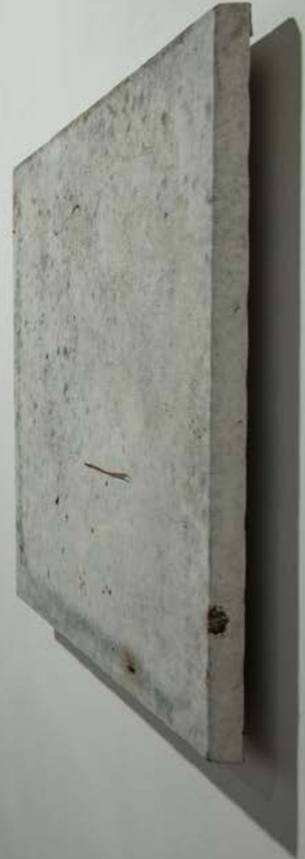
installation view (main gallery) PlaceMAK gallery, Seoul, South Korea

인류가 처음으로 숲에 붓을 넘긴 놀라운 전시회네요. 이 전시회의 메시지가 널리 퍼졌으면 좋겠어요. 세계 미술사에 새 역사가 쓰여지는 전시회입니다. _ 개구리 It is an amazing exhibition, when humankind passes the paintbrush to forest. A new art history is written here, and I hope this message spreads widely. _ Gaeguri