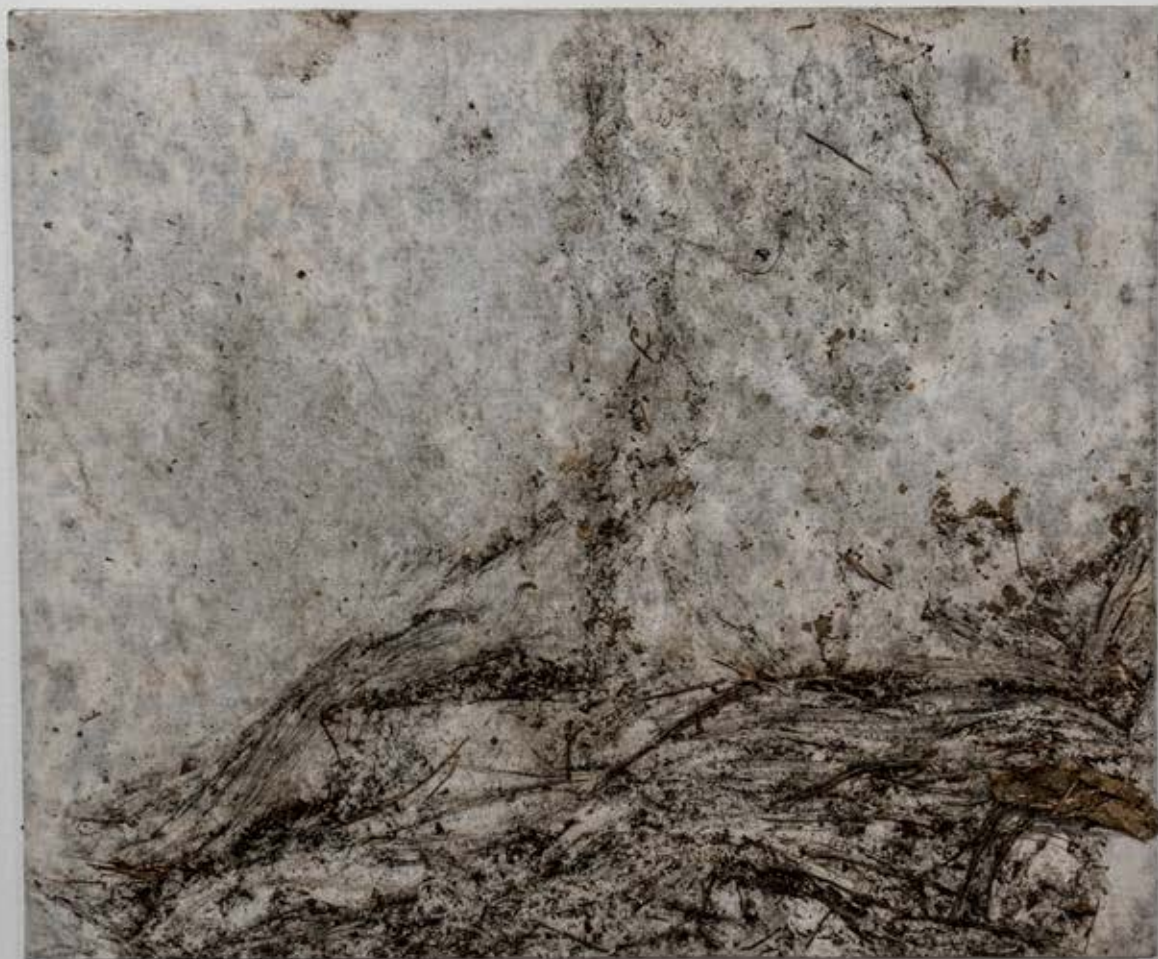
Untitled #3, 46x38, forest on canvas, 2018 Gomsil Forest