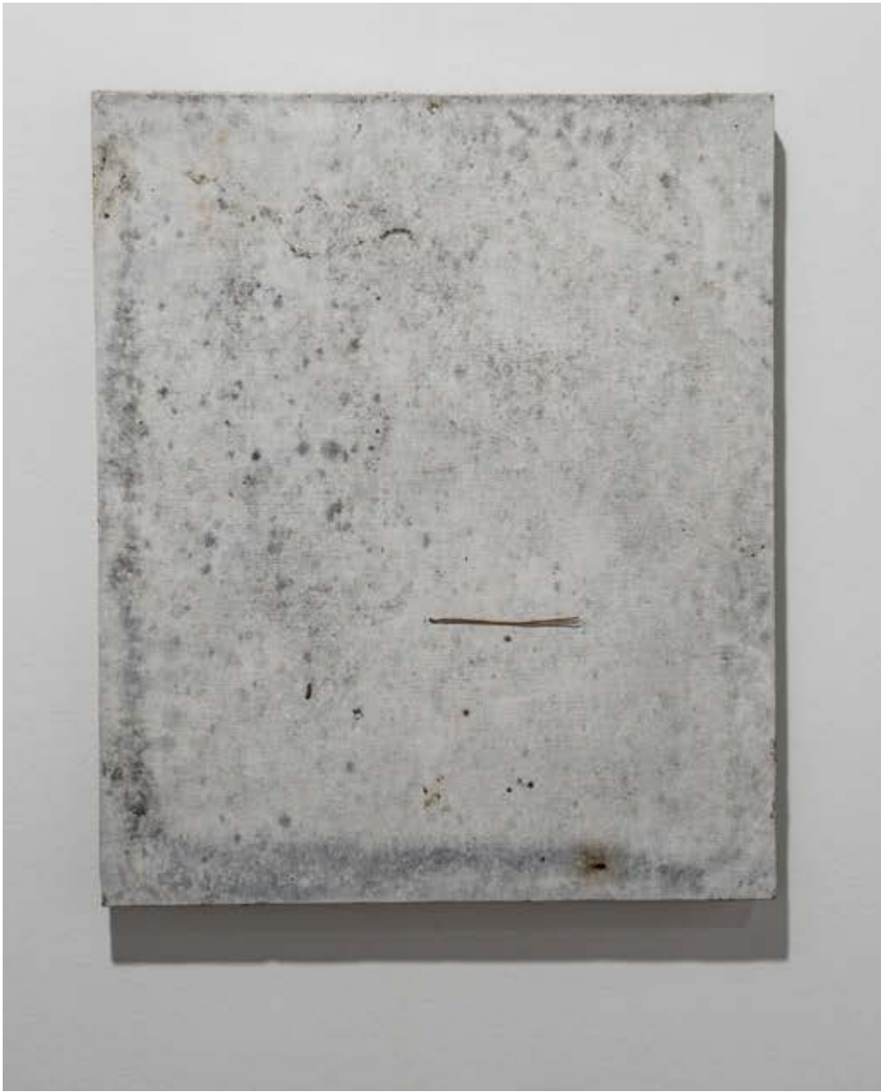
Untitled #6, 46x38, forest on canvas, 2018 Gomsil Forest